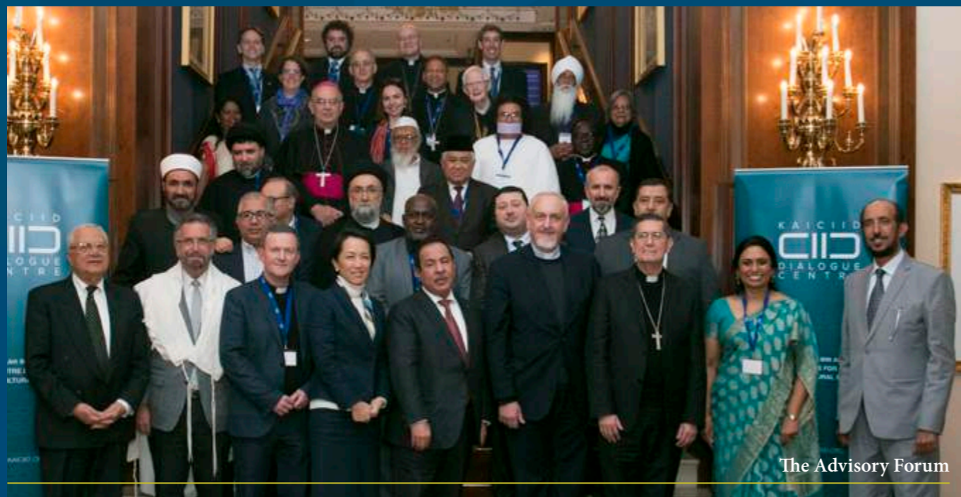
The Advisory Forum