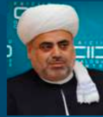
Sheikh Ul-Islam A. Pashazade Chairman of the Caucasus Muslims' Board, and Sheikh Ul-Islam of Caucasus