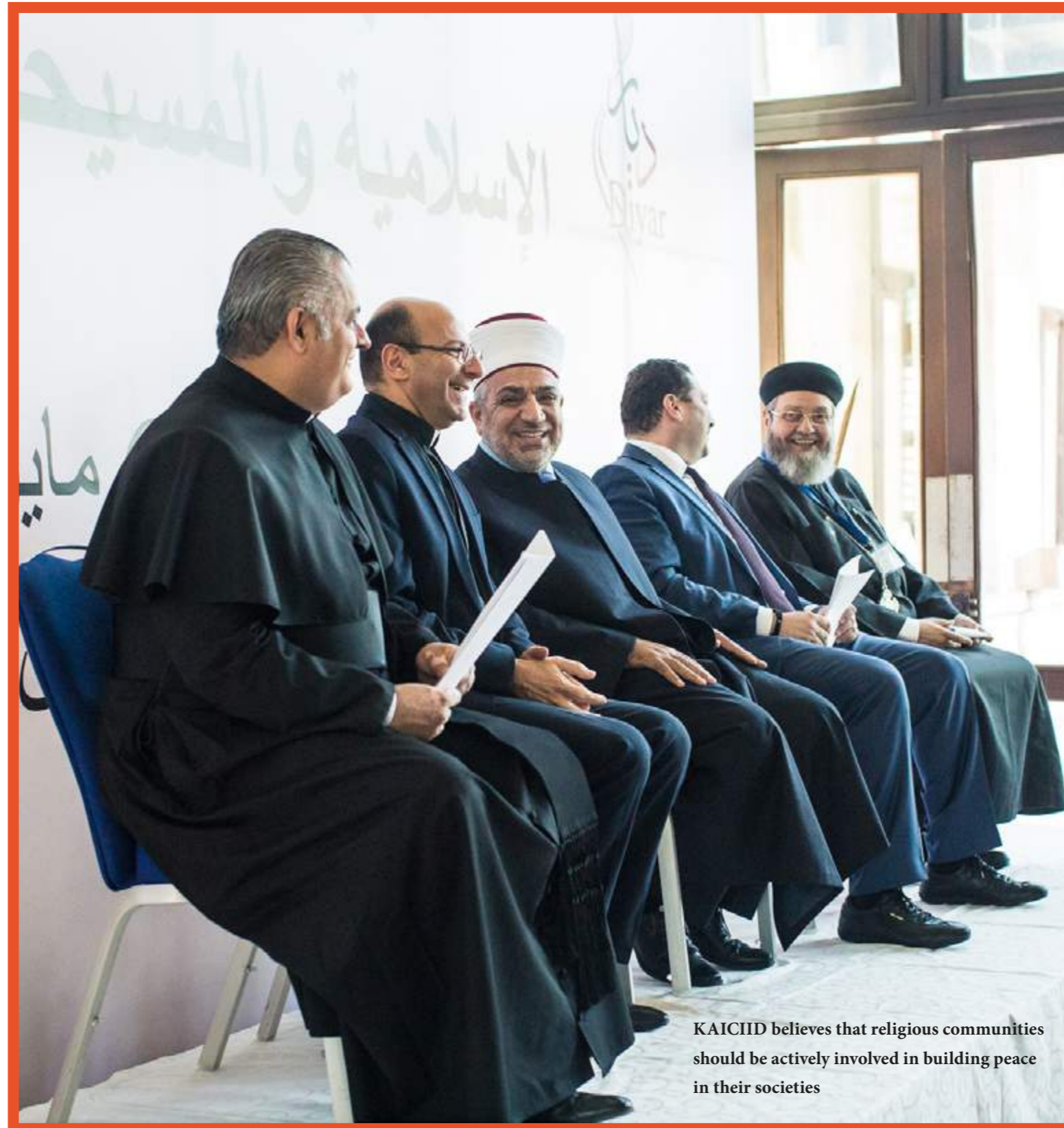
KAICIID believes that religious communities should be actively involved in building peace in their societies

The CAR Country Programme supports the CAR Interfaith Platform, which was established in 2014 by three of the most senior religious leaders in country. The Platform contributes to the reduction of intercommunal tensions and the establishment of lasting peace in CAR. The Platform’s leaders were supported by KAICIID in 2017 to conduct country-wide advocacy efforts for peace and reconciliation in conflict-affected areas, through seven Quick Impact