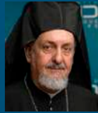
HE Metropolitan Emmanuel Exarch of the Ecumenical Patriarchate of Constantinople