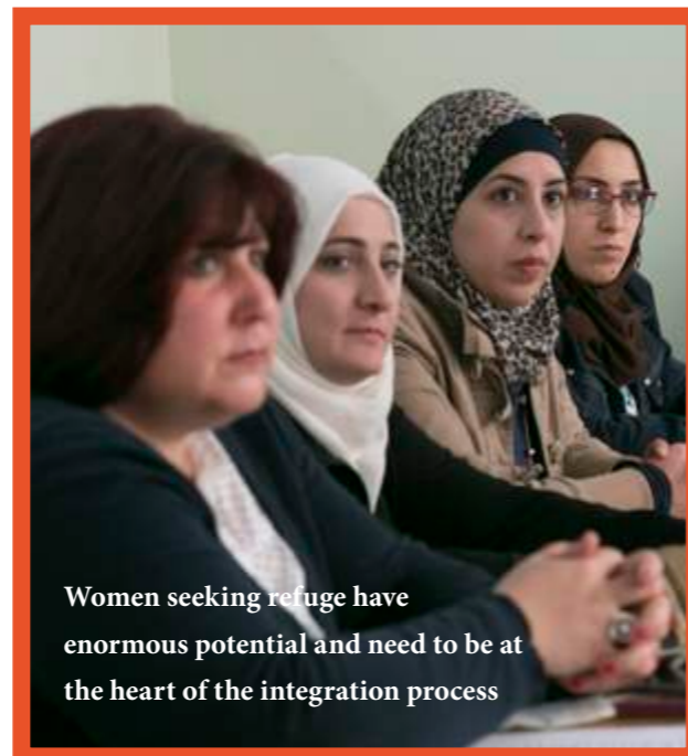
Women seeking refuge have enormous potential and need to be at the heart of the integration process

developing religious education programmes and tools; conducting advocacy efforts and promoting IRD and social cohesion; sensitizing religious leaders and the general public on dialogue and peaceful coexistence; as well as addressing violent extremism and hatred.