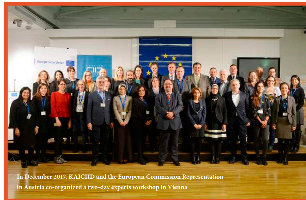
In December 2017, KAICIID and the European Commission Representation in Austria co-organized a two-day experts workshop in Vienna

Since 2012, KAICIID has benefited from long-term partnership frameworks with at least 14 major international organizations and networks, entering into formal collaboration with PARD, UNAOc and the UN Office on Genocide Prevention and the Responsibility to Protect in 2017.